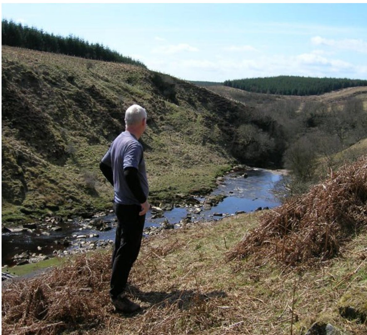
View from Spadeadam Crag (just downstream are some spectacular falls)